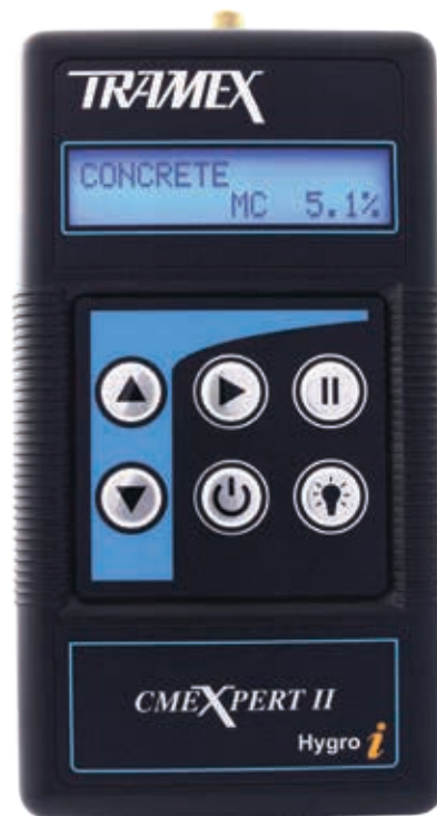
Product order code: CMEX2

Instant and non-destructive moisture content tests per ASTM F2659 with the CME XPERT II, a digital version of the CME4 handheld electronic moisture meter, designed for the instant and precise measurement of moisture content in concrete slabs and giving comparative readings in other cementitious floor screeds. Incorporating plug-in ports for the optional Hygro-i ® relative humidity probe and heavy-duty pin-type wood probes, this meter transforms into the ideal all-in-one instrument for the flooring professional.